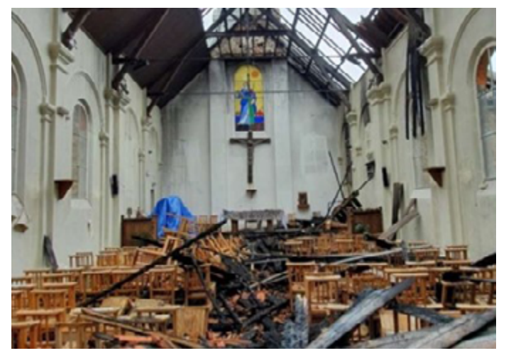
The aftermath of an arson attack at a church in France, 4 July 2020.