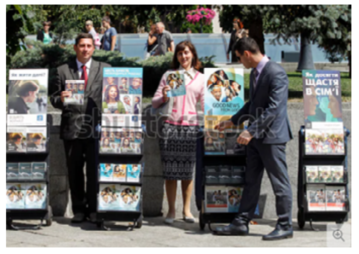
Jehovah's Witnesses hand out religious materials in Kyiv, 4 August 2019.

Given the numerous religious denominations and movements that comprise Christianity, crimes motivated by a bias against Christians can take many different forms. Victims