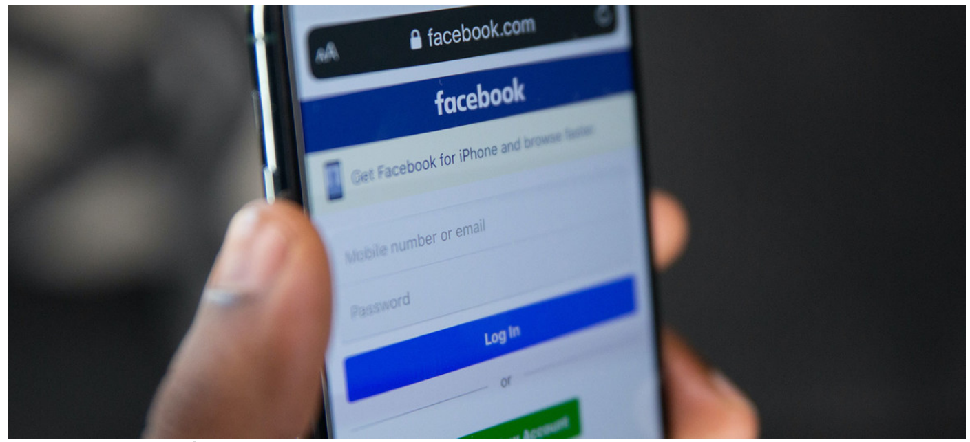
Facebook's application is displayed on a smartphone.

23 December 2020 Human Rights (/en/news/topic/human-rights)